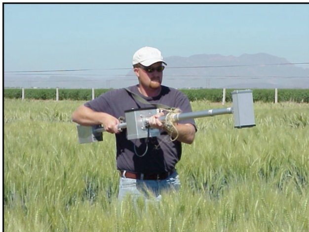
Figure 3. Passive sensor measuring reflectance in spring wheat, Ciudad Obregon MX.

With the benefits of the sensor-based technologies established, there was a need to devise a method to disseminate the findings, therefore in 1996 TEAM-VRT put together two