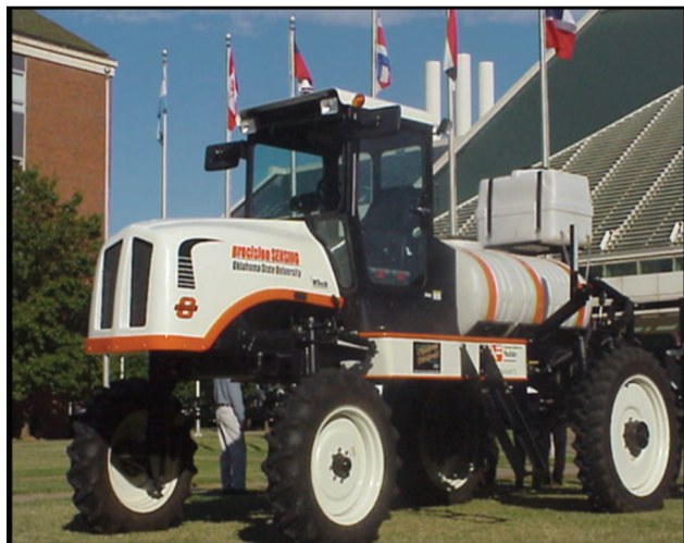
Figure 6. The Cherokee VRT applicator, this sprayer has a 60 ft boom with sensors mounted every 2 ft along the boom.

From 2003 to date, sensor technology and our understanding of its abilities has expanded. This has led to several revisions of the sensor technology since the introduction of the first GreenSeeker™ in 2002. At publishing time of this Fact Sheet, the NUE website hosts 24 SBNRC algorithms for multiple crops, states, and nations. Each algorithm was