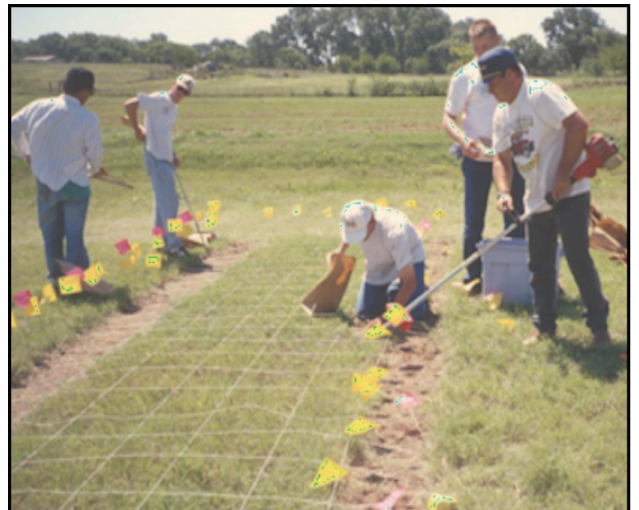
Figure 2. Soil sampling 1 ft 2 showed significant variation in plant available nutrients.

question to Dr. Bill Raun (PSS): “At what resolution are there real differences in the field?” To answer this question, an experiment was conducted to determine the extent of spatial variability of soil properties, and the variability in yield from what was a visibly homogenous area. This was performed by collecting soil and forage samples from every square foot over a 7-foot by 70-foot area (Figure 2). The results showed that there were significant differences in soil properties from