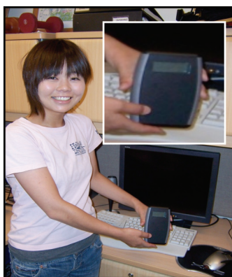
Figure 7. Prototype of the pocket sensor.

The development of sensor-based technologies was timely, coming at a time when producers faced issues with the rising cost of production and the focus on environmental pollution due to overapplication of N fertilizers. Current efforts include the development of a low cost “pocket” sensor (Figure 7). This new sensor is relatively inexpensive and will increase the adoption of this technology worldwide, especially in developing countries where N fertilizers are underapplied due to limited resources.