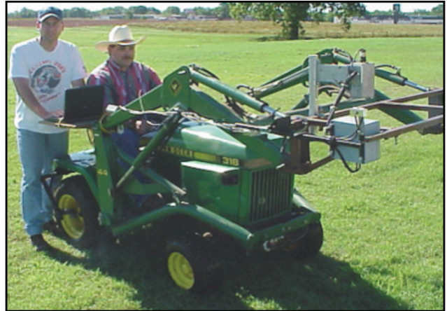
Figure 1. NDVI sensor readings being collected on bermudagrass, Stillwater, OK, 1997.

Oklahoma Cooperative Extension Fact Sheets are also available on our website at: http://osufacts.okstate.edu