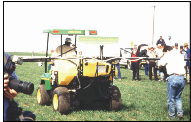
Figure 4. The first demonstration of sensor-based variable N application, Hennessey, OK., 1996

web sites, these two sites have been molded into the current www.nue.okstate.edu website. The web has become an essential tool in the education and use of sensor-based technologies. Since the initiation of the websites, more than 150,000 people have visited these sites